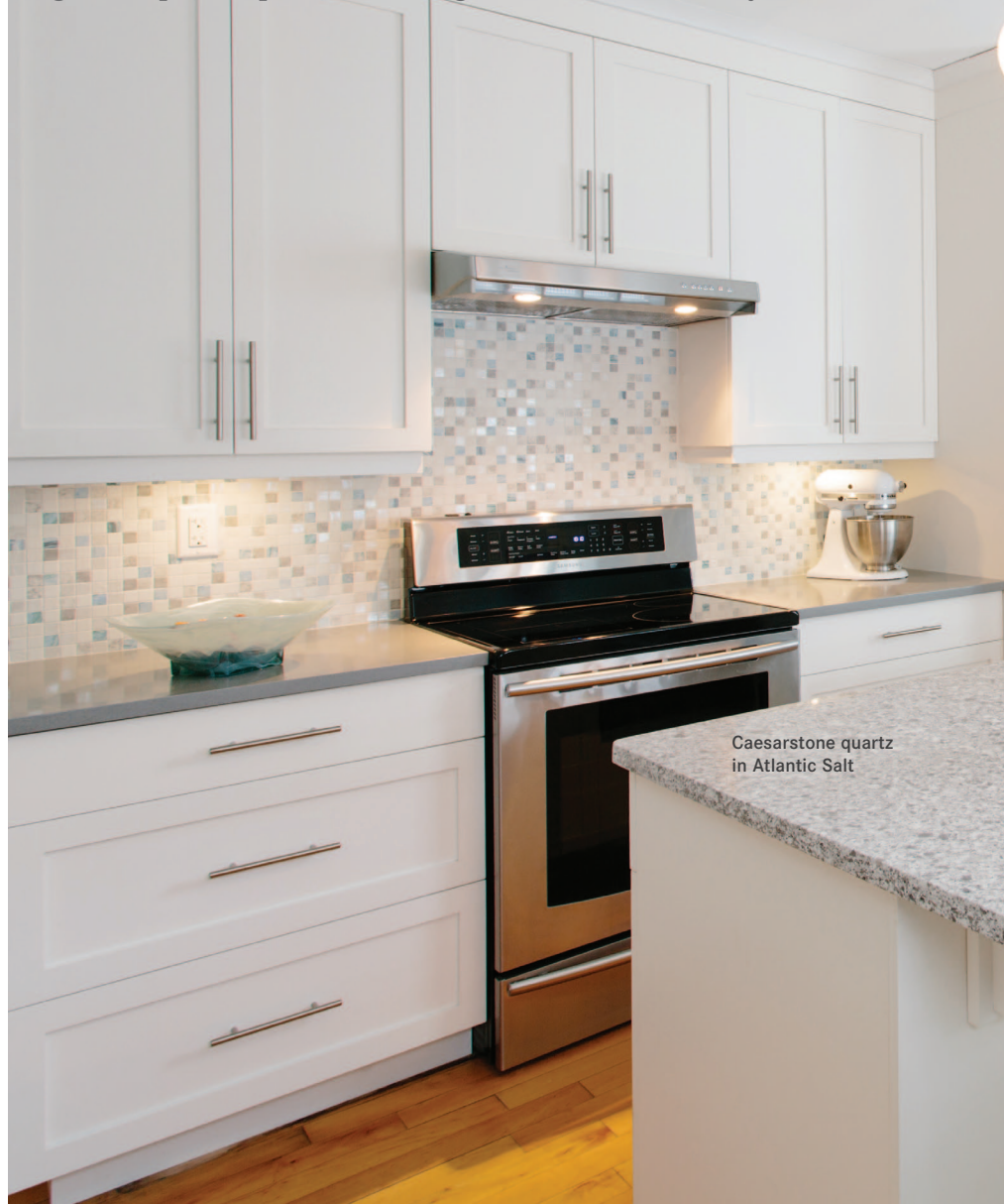
Caesarstone quartz in Atlantic Salt

Balancing functionality and beauty, Kitchen Design Plus helped lighten up this space and bring the beach to the city.